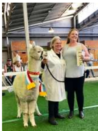
Grand Champion Female Huacaya Patagonia Celtic Cabaret ET