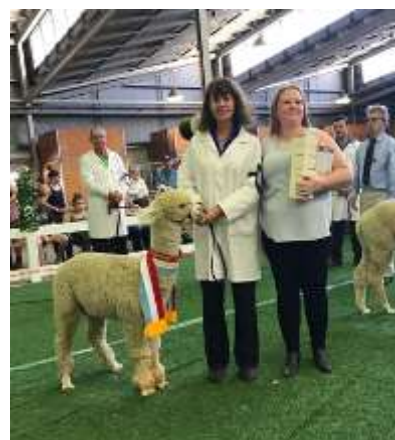
Grand Champion Male Huacaya Bedrock Pakiri