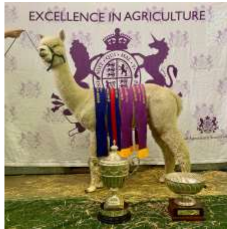
Bedrock Pakiri - Best in Show Huacaya 2019

A huge thankyou to all exhibitors who put in such a massive effort to join us for the 5 days of Sydney Royal. It is a big commitment but just ask anyone and I'm sure they will say, it's a wonderful fun time spent catching up with friends and plenty of networking over a few bottles at night beside the huts. Only a few bottles of course!