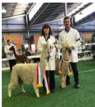
Grand Champion Female & Male Suri's Bedrock Calley & Bedrock Comic