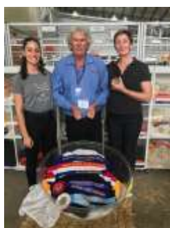
Supreme Champion Suri Fleece Tularosa Karate Kid