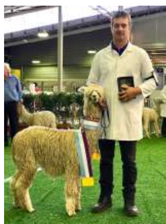
Best Suri Alpaca in Show 2019 Bedrock Comic