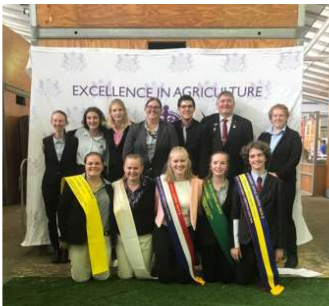
Young Judges Competition 2019