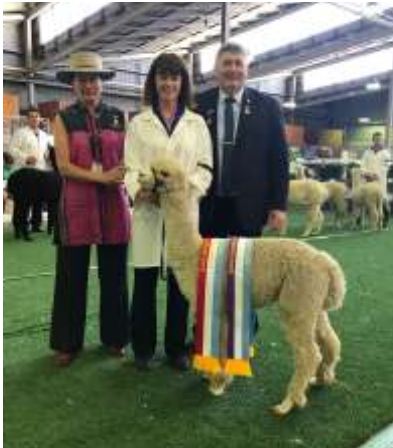
Best Huacaya Alpaca in Show Bedrock Pakiri