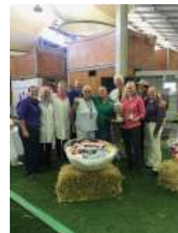
Supreme Champion Huacaya Fleece EP Cambridge Connoisseur